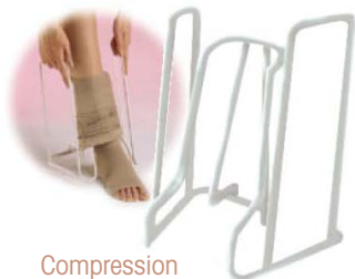
Compression Application Aid