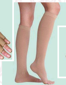
Women's Knee High