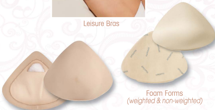
Foam Forms (weighted & non-weighted)