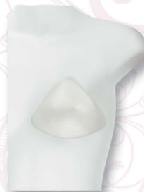
Variety of Swimforms Available