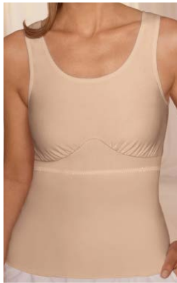
Post-op Camisoles (drain pouches & fluff forms included)

Comfort from the start... during the healing process which is on average 4-6 weeks post-surgery.