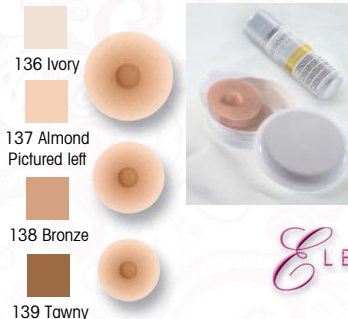
Adhesive Nipples (covered by most insurance plans)