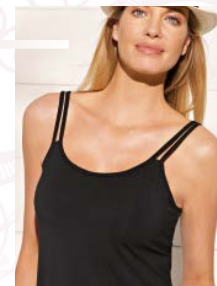
Valetta pocketed Camisoles (asst. colors)