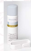
Breast Form Cleanser

Elegant Essentials offers an extensive collection of accessories for practically every woman's needs. If looking for something specific, ask us, as chances are, your solution exists!