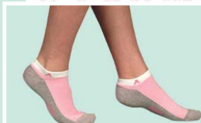
Pink Ribbon Socks