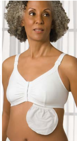
Hannah bra w/drain pouch