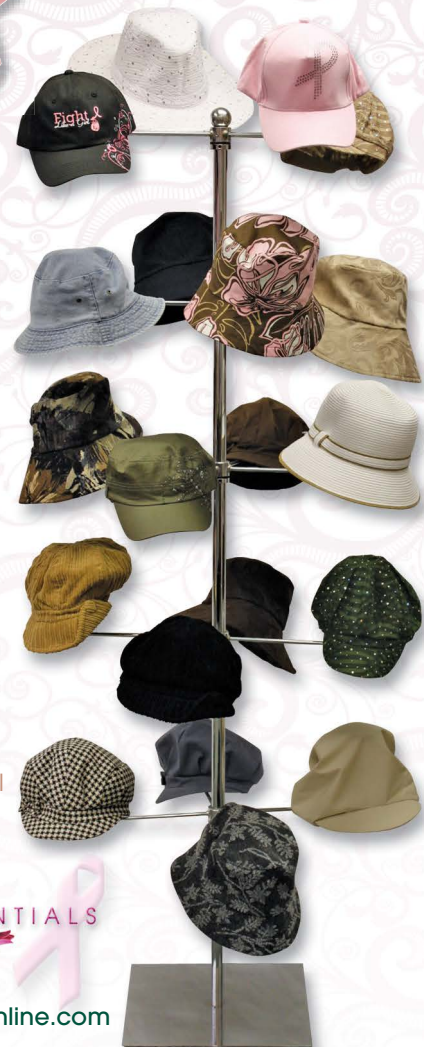
Assortment of seasonal appropriate headwear